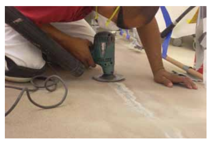
ABOVE — "We used hand grinders equipped with 12" (30.48cm) disks to reach into the corners," says Tabrizi. "We created a heavy profile."