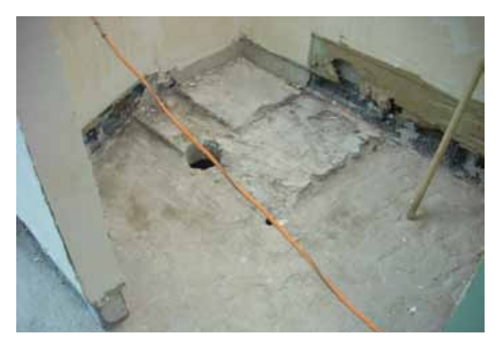
ABOVE - "When we demoed the existing tile deck we discovered a 5" (12.7cm) sand mortar aggregate. This was unusable for our specified coating application and the floor had to be resloped."