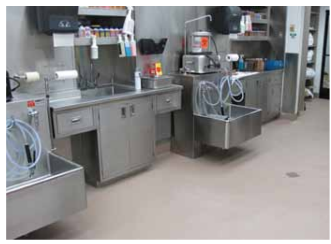
ABOVE The Raider crew roller-applied the formaldehyde-resistant Wearcoat 100 top coat at a DFT of 4 mils (0.102mm) per coat. "And we put on two coats. We aren't taking any chances," says Tabrizi.