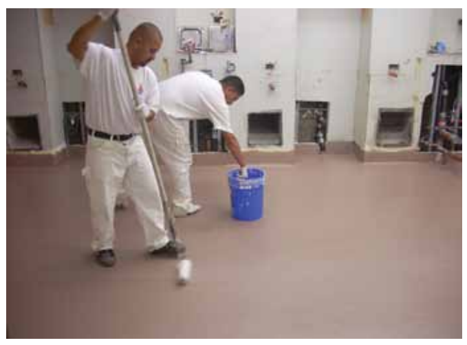
ABOVE → The crew roller-applied 20 mil (0.51mm) DFT coat of Pacific Polymers' Elastomeric 6001, on top of the 3 to 4 mil (0.076mm-0.102mm) DFT primer and the Mapei system. But they had only just started.