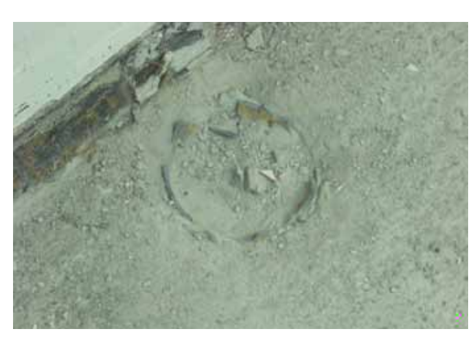
ABOVE A "As we exposed the slab we uncovered an old set of unused pipes that given — the age, setting, and possible use — had to be removed by the mortuary," explains Tabrizi.

that the pipes were removed and that the room was cleaned and decontaminated. Then we returned."