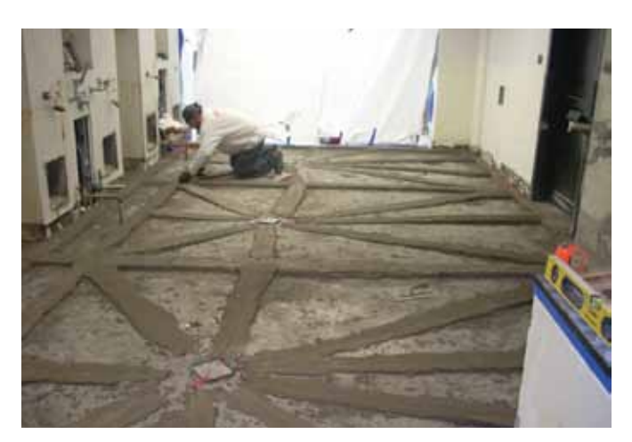
ABOVE ☐ The crew used lasers and level strings and Mapei's Mapecem 202 — a polymer-modified, fast-set cementitious mortar — to build curbs for sloping. Any gaps between the slab and the drains were bridged with EPMAR's SS1202-2 epoxy filler.